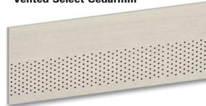
Color Shown: Cobble Stone