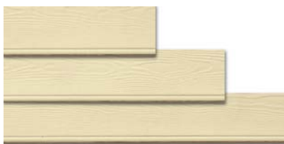
Color Shown: Woodland Cream