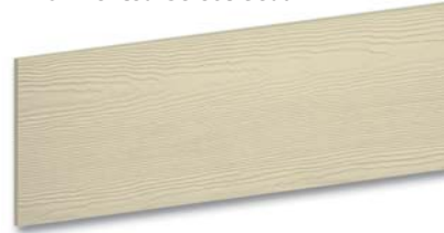
Color Shown: Navajo Beige