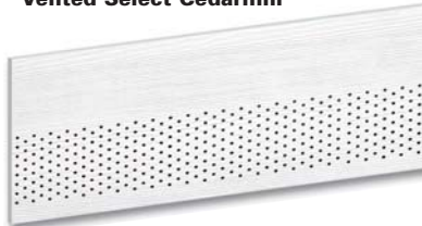
Color Shown: Arctic White