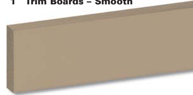
Color Shown: Khaki Brown