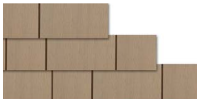
Color Shown: Khaki Brown