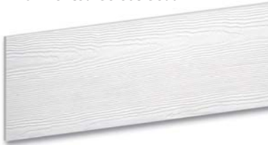
Color Shown: Arctic White