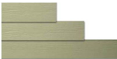
Color Shown: Heathered Moss