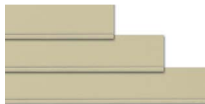
Color Shown: Sandstone Beige