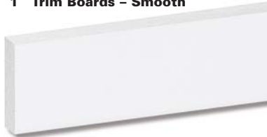
Color Shown: Arctic White