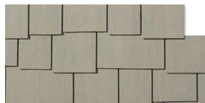
Color Shown: Monterey Taupe

See reverse side for Trim & Soffit Offering.